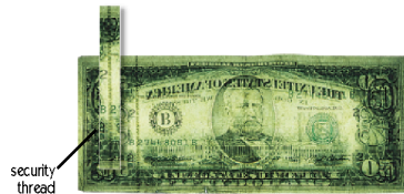
Figure D - Series 1990 through 1995