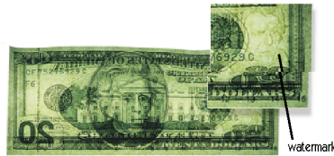
Figure C - Series 1996 and later